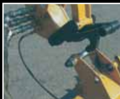
Quick Hitch® quick attach system.

Mounts to all Alamo Industrial Boom Mowers including the A-Boom, Versa® Boom, Machete®, Rear Mount Boom and the Maverick™, which are available in ranges from 17' up to 30'. When used in conjunction with the Quick Hitch® quick attach system, the BuzzBar can be taken off and switched with another head in minutes! (Some models of the BuzzBar are not available for use with certain boom lengths – inquire with customer service for specific combinations.)